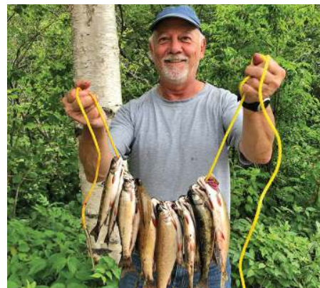
A gorgeous morning for fishing!