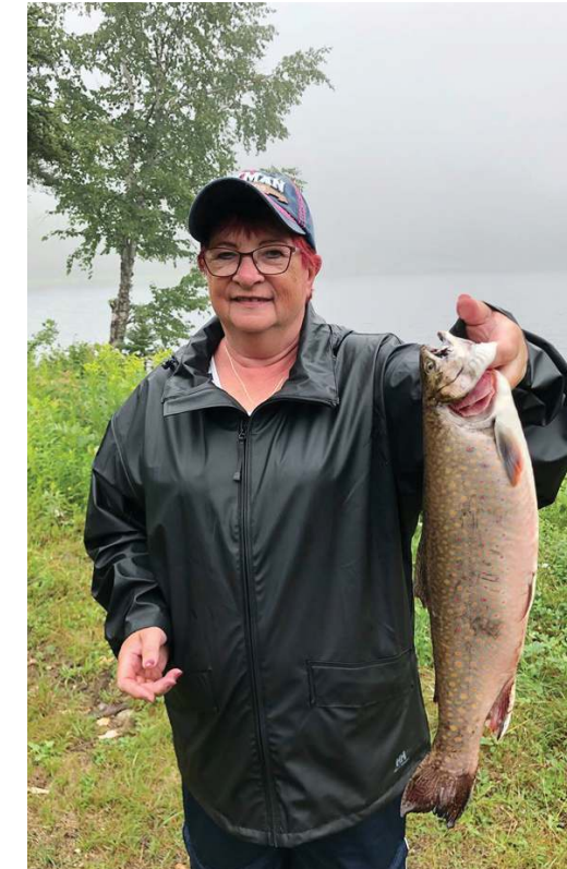
Beautiful 18 ½" trout, captured at the beginning of August