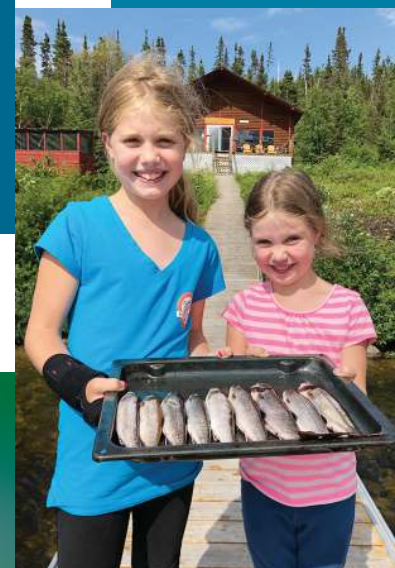
Two regular guests, loyal since birth!

With the coming Holidays we want to wish you prosperity and passion in your favorite activities. May love and health be with you and your loved ones for the year to come.