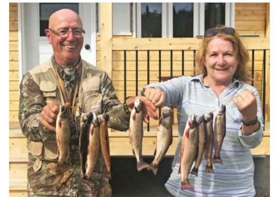
Great fishing at Jumeaux lake