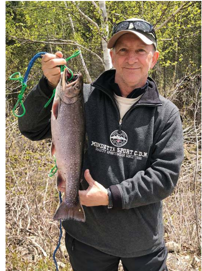
Superb 19 ¼" speckled trout caught at the beginning of June

This summer, food was plentiful in all our lakes during the entire season because of the unusually high water levels and an impressive insect outbreak. For this reason, both patience and skills were necessary to catch trouts. However, against all odds, you managed to capture more than 12,800 trouts. Congratulations to all our fishermen who, year after year, contribute to our success!